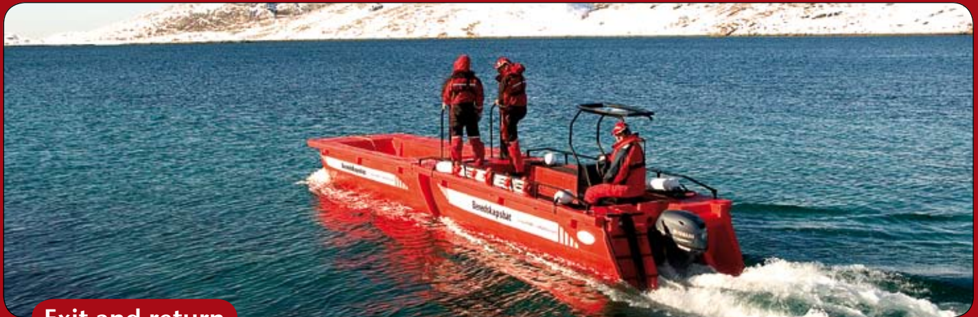
Exit and return